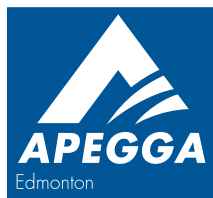
PMS 294 C

Black and White: In black and white publications, a black version of the logo or a white (reversed out of black background) version may be used based on the design of the print piece. When printing on paper stock other than white, it is strongly recommended that the black version of the logo be used. These guidelines apply to web applications of the logo as well. It is recommended that the black or reversed version of the logo be used when the background is any colour other than white.