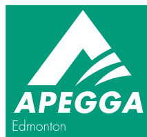
PMS 340 C